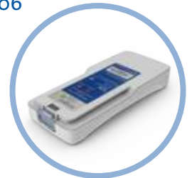
Inogen One ® G4 Lithium Ion Battery* Up to 3 hours run time Item #BA-400

Approximately half the size of the Inogen One G3!