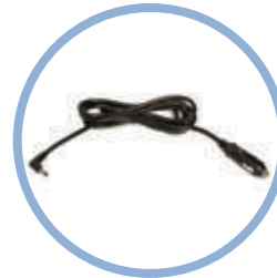
Inogen One ® G4 DC Power Cable* Item # BA-306