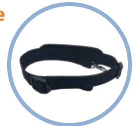
Inogen One ® G4 Carry Strap* Item # CA-401

Approximately half the size of the Inogen One G3!