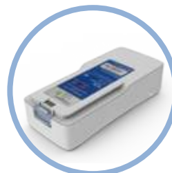
Inogen One ® G4 Extended Life Lithium Ion Battery** Up to 6 hours run time Item #BA-408