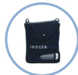
Inogen One ® G4 Carry Bag* Item # CA-400